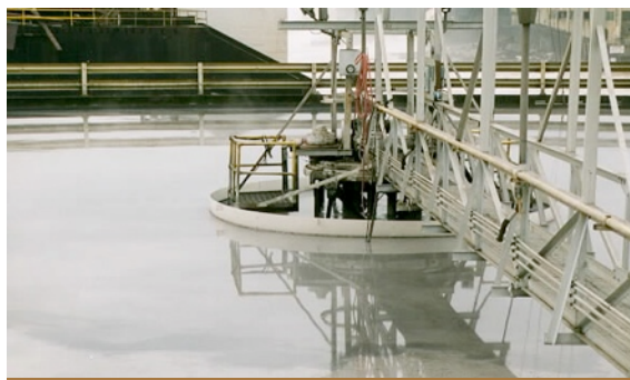
Wastewater Treatment Clarifier Coated with DuraShield 310

In 1996 Blue Heron Corporation's Newsprint Mill in Oregon City, Oregon, had an opportunity to perform a close inspection of their wastewater treatment clarifier. Upon inspection they discovered the concrete structures of their clarifier, particularly the walls, were experiencing extensive corrosive attack. The corrosion was so