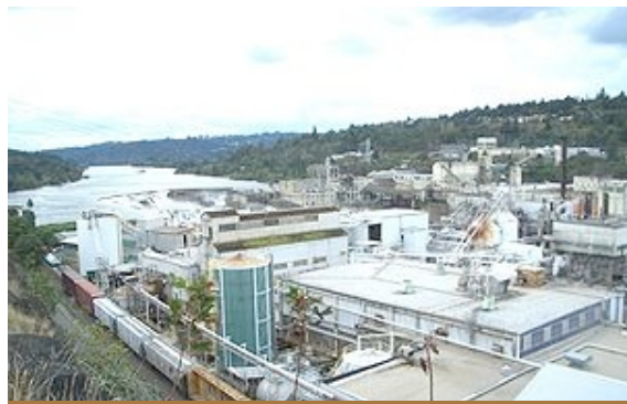
Blue Heron Paper Mill

extreme that rebar was exposed in areas and the aggregate was protruding as much as 1/2" in spots. They needed something to eliminate the corrosive attack caused by the hydrosulfurous acid, sulfuric acid and hydrogen sulfide gas present in the system.