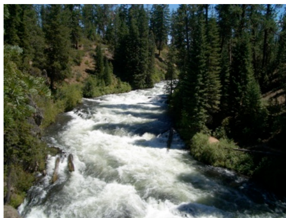
The Deschutes River in Central Oregon

LifeLast is honored to be a sponsor and partner in the renewable energy movement. The physical properties of DuraShield polyurethanes, including low coefficient of friction, make LifeLast the industry choice for linings and coatings of welded steel pipe for hydroelectric applications. Plus LifeLast's products are 100% solids and bio-based, a solution that is eco-friendly and efficient for the project owner and the surrounding environment.