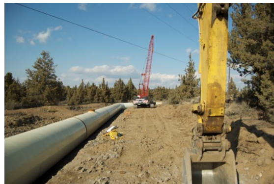
Pipe Laying Operation at Juniper Ridge

In 2009 construction began to enclose 13,000 lineal feet of The Juniper Ridge Canal which runs for 22 miles, north of Bend, Oregon. Slayden Construction Group installed the 108" welded steel pipeline milled at Northwest Pipe's Portland, Oregon facility. The pipeline was lined and coated with LifeLast DuraShield 210 polyurethane at 40 and 25 mils respectively.