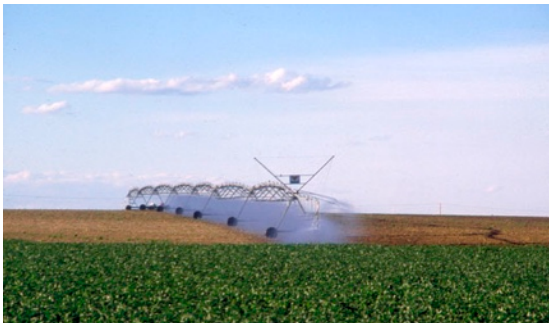
Farmland Irrigation in Central Oregon

The Central Oregon Irrigation District (COID) looks at irrigation canals as more than just a way to distribute water from the Deschutes River to farmers and ranchers. With rising energy costs and the desirability of renewable energy sources, the power of water rushing through their canals is viewed as a source of power and revenue.